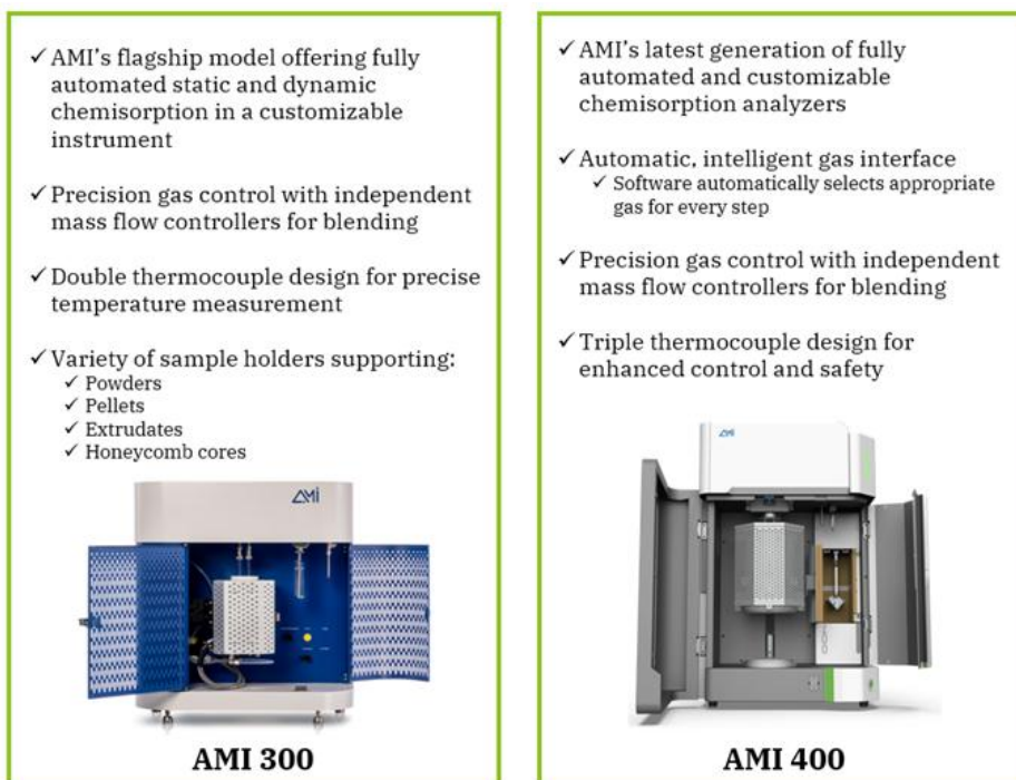
Figure 2: Highlighted features of AMI 300 and AMI 400 series of chemisorption analyzers

series of chemisorption analyzers provide highly precise and accurate measurements for static (volumetric) chemisorption, pulse chemisorption, and TPD experiments. They are also highly customizable, allowing for a variety of sample types, unique experiment design, and optional in situ spectrometry. These features, described in Figure 2, make AMI chemisorption analyzers an excellent tool for a broad range of chemisorption experiments.